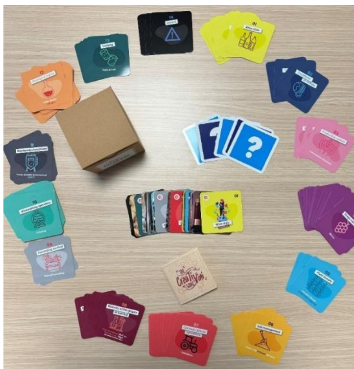
Figure 1: The Creativini game is composed of 145 printed cards divided into 14 different batches, and of 5 empty cards that can be freely used by players to suggest a missing operation