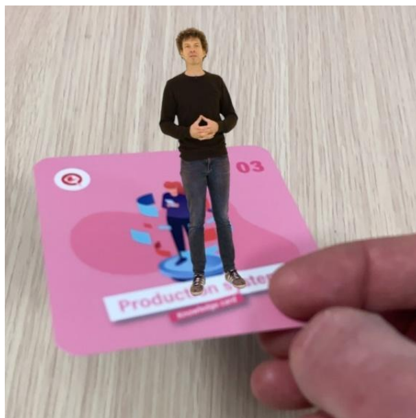
Figure 3: The game includes some augmented reality content providing information or explanations on the cards in the form of video clips. Such content can be accessed on any smartphone using the ArgoPlay app.