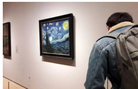
Figure 1. Visitor reading The Starry Night's label, MoMA, New York, photo by author, April 2022

Upon visiting the MoMA in April 2022, I observed that van Gogh's masterpiece was a highly sought-after attraction. The majority of visitors spent only a few minutes at the painting, taking pictures or selfies. It was quite difficult to get close to the painting due