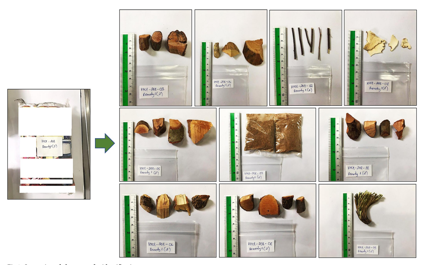
Fig 1. Separation of plant parts for identification.

In the TA PROHM study, HBsAg and HBeAg RDTs were performed following a sequential testing algorithm. First, all pregnant women were tested with the SD BIOLINE HBsAg RDT