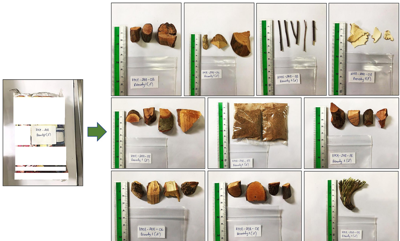
Fig 1. Separation of plant parts for identification.

In the TA PROHM study, HBsAg and HBeAg RDTs were performed following a sequential testing algorithm. First, all pregnant women were tested with the SD BIOLINE HBsAg RDT