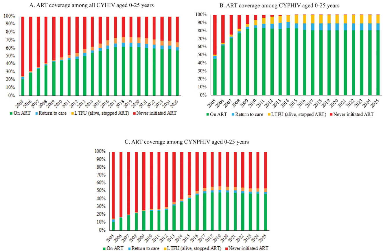
Fig 3. ART coverage among CYHIV aged 0–25 years in Thailand, 2005–2025. The vertical axis shows the proportion of all CYHIV aged 0–25 years in Thailand who fall into each category of ART coverage: on ART (green), returned to care (blue), stopped ART (yellow), and never initiated ART (red). The horizontal axis shows each calendar year from 2005 to 2025. Each panel represents either all CYHIV (A), only CYPHIV (B), or only CYNPHIV at the age of 13–25 years (C). ART: antiretroviral therapy, CYHIV: children and youth living with HIV, CYPHIV: children and youth living with perinatally acquired HIV, CYNPHIV: children and youth living with non-perinatally acquired HIV.

https://doi.org/10.1371/journal.pone.0276330.g003