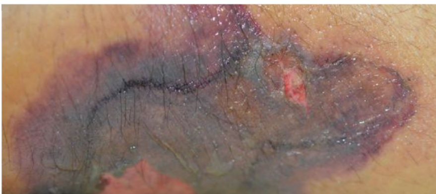
FIGURE 1 macroscopic view of the necrotic lesions