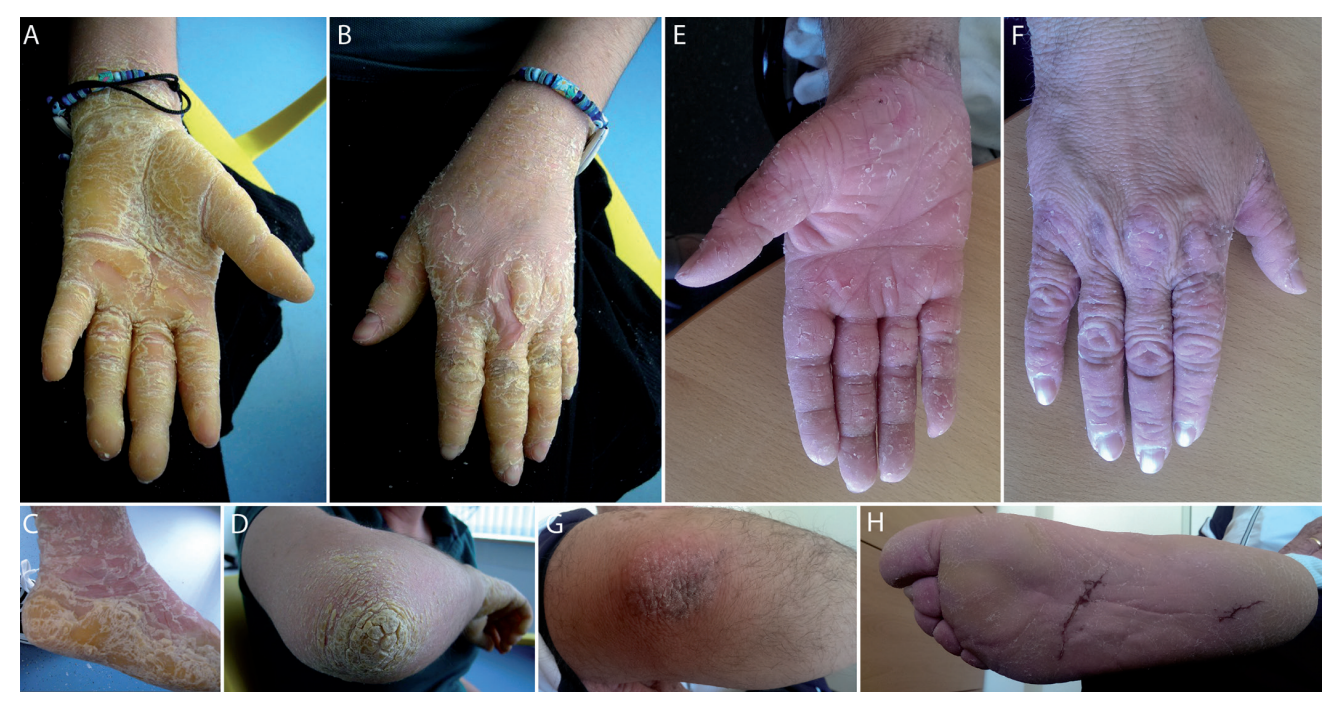
Fig. 2. Clinical examples of patients with epidermolytic ichthyosis (EI) and mutations in KRT1: patient P5 shows EI with (A–C) severe palmoplantar keratoderma (PPK) and (D) hyperkeratosis on the elbows. (E–H) A milder phenotype is presented in patient P10 with moderate PPK. The patient has the novel mutation c.1752dupT, p.Gly585Trpfs69*.

Additional splice site mutations in the same splice site region described above, the mutations c.1374-1G>A,