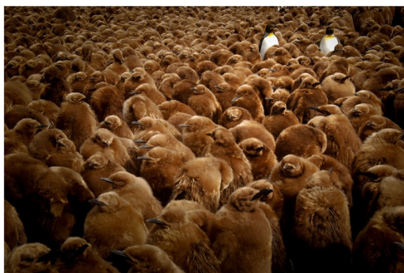
Figure 8 Winner: editor's pick. "King penguin chicks ( Aptenodytes patagonicus ) huddle together in huge crèches of several thousand chicks."

"As the center of marine biodiversity, there are over 350 species of coral and 500 species of fishes in Tubbataha. A young, tabulate Acroporid coral can be seen reaching its branches toward the sun to fuel its Symbiodinium algal symbionts with a plethora of reef fishes in the background. It is the marine equivalent of a young tree shooting skyward to fulfil its ecological role in a forest. Corals, branching Acroporids especially, contribute greatly to habitat complexity, or