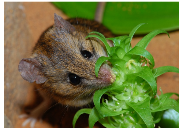
Figure 1 Overall winner. "A Namaqua rock mouse ( Aethomys namaquensis , Muridae) getting dusted with pollen of the Pagoda Lily ( Whiteheadia bifolia , Hyacinthaceae) while lapping nectar at the flowers."

At first glance, this image of a Namaqua rock mouse ( Aethomys namaquensis , Muridae) getting dusted with pollen of the Pagoda Lily ( Whiteheadia bifolia , Hyacinthaceae) might not appear to be particularly striking. But this is an image that is much more than it at first appears. In contrast to last year's winning image, of an evolutionary adaptation driven by the avoidance of death, this year's winner offers a fascinating window into a highly unusual evolutionary game in which mutual benefits aid the struggle for survival and reproduction. We tend to think of insects, and occasionally birds, when we think of pollination ecology, and this winning image therefore serves as a reminder of the variety of different ways in which nature