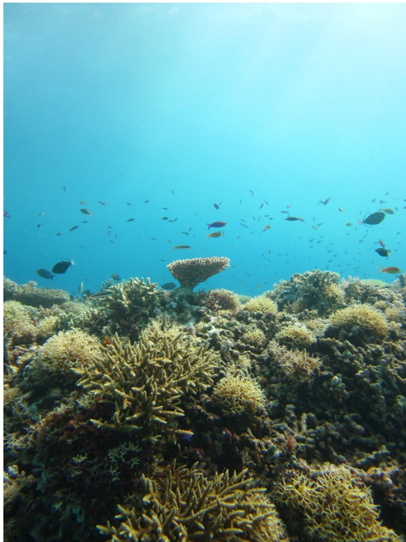
Figure 5 Winner: conservation ecology and biodiversity.

"The image was taken on a Catlin Seaview Survey expedition to Tubbataha Natural Park of the Philippine waters of the Sulu Sea in the heart of the Coral Triangle. A young, tabulate Acroporid coral can be seen reaching its branches toward the sun to fuel its Symbiodinium algal symbionts with a plethora of reef fishes in the background. It is the marine equivalent of a young tree shooting skyward to fulfil its ecological role in a forest. Corals, branching Acroporids especially, contribute greatly to habitat complexity, or rugosity, of reefs increasing the microhabitats for other reef creatures."