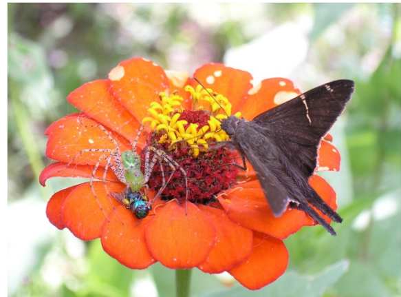
Figure 4 Winner: community, population and macroecology.

"A crab spider on a flower preying upon a euglossine bee, while a butterfly looks for nectar, taken on the slopes of Cerro Chucantí, Darién Province, in eastern Panama. Note, the bee had already filled his 'saddle bags' with pollen before being attacked by the spider. The petals on the far side of the flower also appear to be succumbing to some kind of blight, perhaps due to a fungus."