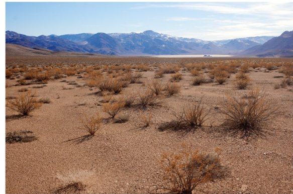
Figure 6 Winner: landscape ecology and ecosystems. "An endorheic basin in Death Valley, California. Although annual precipitation rarely exceeds 100 mm/yr, a small number of plants are able to survive on the gravelly slopes of the valley and on the muddy lakebed. Thousands of years ago this valley would have been far more wet and lushly vegetated."

This moment, the first report of a parasitoid attacking Camponotus morosus , or any Camponotus ant in Chile,