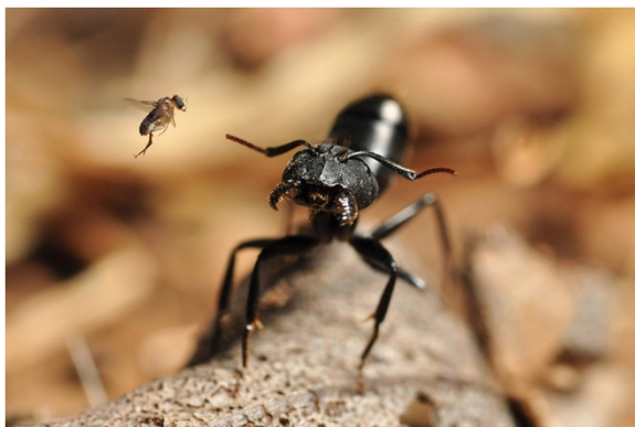
Figure 3 Winner: behavioural and physiological ecology. " Camponotus morosus ant being attacked by a parasitoid phorid fly (Diptera: Phoridae). At the moment of the attack the ants were involved in an intra-specific fight between two different ant nests and presumably the fly detected the ants because of the alarm pheromones released during the fight."