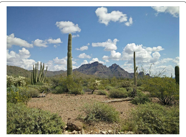
Fig. 7 Winner: Landscape Ecology and Ecosystems. "Deserts are alive. The scene pictured captures a time of year when the Sonoran desert in North America becomes an oasis: the winter growing season. Here in Organ Pipe Cactus National Monument in southern Arizona, winter rains, relatively cool temperatures, and overcast skies allow annual plant species to germinate and perennial species to flourish, creating suitable habitat and food for migratory species and year-round inhabitants." Attribution: David Winkler.

"Like last year, it's a picture of a desert. But this year we have these very nice cacti! Such columnar cactus are pollinated nightly by bats (the lesser long-nosed bats, Leptonycteris curasoae), which pollinate the flowers by feeding on their nectar. Later in the year, the bats become fruit-eater and eat the fruits of the cactus. Doing so, they participate to the dispersal of the seeds. This nice interaction between the cactus and the bats, shows the power of co-evolution."