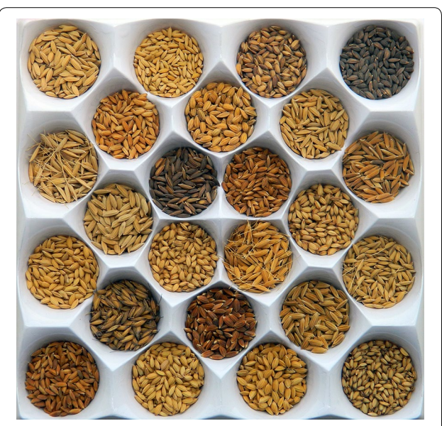
Fig. 6 Winner: Conservation Ecology and Biodiversity Research . "Rice, the staple food crop of millions, contributes a large part of the caloric intake of people. India possesses enormous wealth of diversity in rice, especially for non-Basmati type, short grain aromatic rice. This photograph shows grain diversity, in both grain shape/size and lemma-palea color, revealing a diverse set of short grain aromatic rice collection for their utilization."