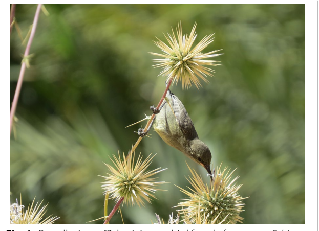
Fig. 1 Overall winner. "Palestinian sunbird female forages on Echinops sp."

"The Greater Adjutant Stork (Leptoptilos dubius) is the world's most endangered stork species with a total population estimated between 1,200 to 1,800 individuals. The Brahmaputra Valley is considered the last stronghold of this endangered stork and harbors more than 80 per cent of the global population of the species. Guwahati City's urban garbage dumps