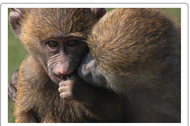
Fig. 9 Winner: Editor's Pick. "As one juvenile baboon ( Papio sp.) eats, another inspects the food item." Attribution: Catherine Markham.

"As a primate behavioral ecologist, I'm interested in how the social bonds between individuals affect foraging strategies and success and—ultimately—individual survival and reproduction."