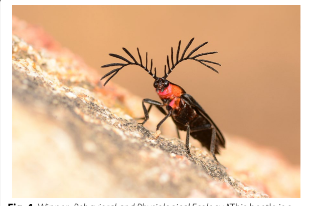
Fig. 4 Winner: Behavioral and Physiological Ecology. "This beetle is a lampýridae from central Chile, and has some impressive antenna wish he uses to smell females."