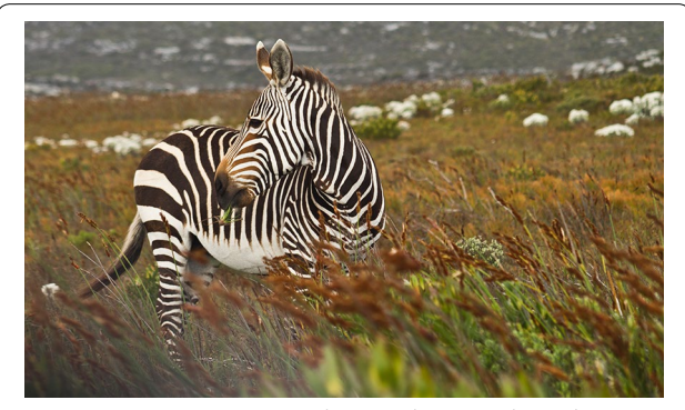
Fig. 5 Winner: Community, Population and Macroecology. "This picture of a grazing cape mountain zebra ( Equus zebra zebra ) was taken near the Cape of Good Hope in South Africa. Cape Mountain zebra feed mainly on grass, the red grass Themeda triandra and other climax grasses such as finger grass Digitaria eriantha and terpentine grass Cymbopogon plurinodis being particularly favored."

"These valuable heritage resources are on the verge of extinction due to a lack of research attention. However, these exotic germplasm possess many novel